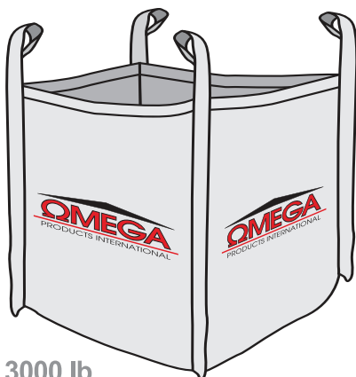
3000 lb Bulk Sack

Diamond Wall exceeds ASTM C926 and provides continuous exterior insulation meeting new energy saving requirements.